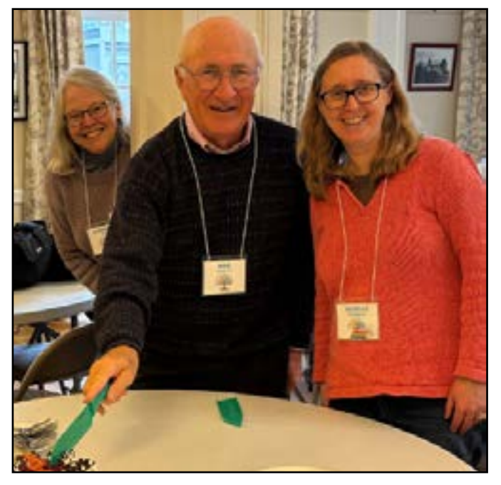
to cut the birthday cake after worship on the first Sunday peeking around the

One of the ideas that is moving forward is to line Ralston Avenue with banners on light poles to celebrate the building that was here before the city was a city. More on that to come. Stand by!