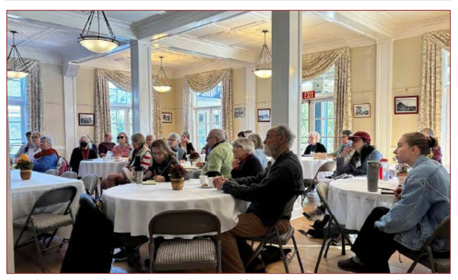
People from throughout San Mateo County gathered in the CCP Dining Room to hear how to resist ICE arrests.

751 Alameda de las Pulgas, Belmont CA 94002 • 650-593-4547 • Office@ccpeninsula.org • www.CCPeninsula.org