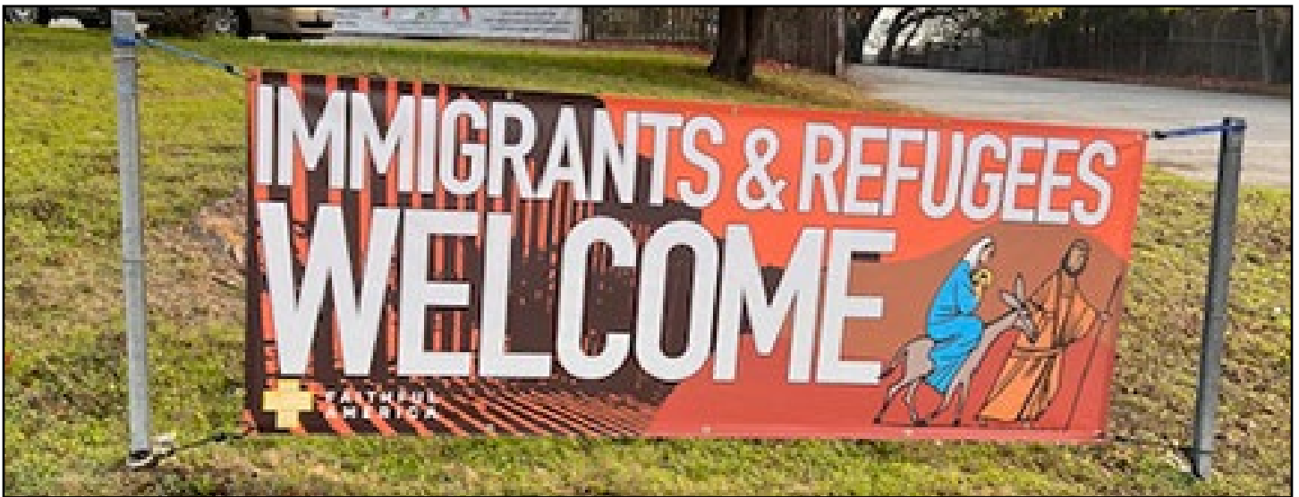
This banner, with its image of the Holy Family, replaced our Ceasefire banner, for the holiday season.