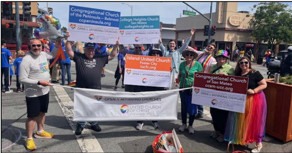
Our contingent in the San Mateo Pride Parade along with the other churches in our Open & Affirming cluster