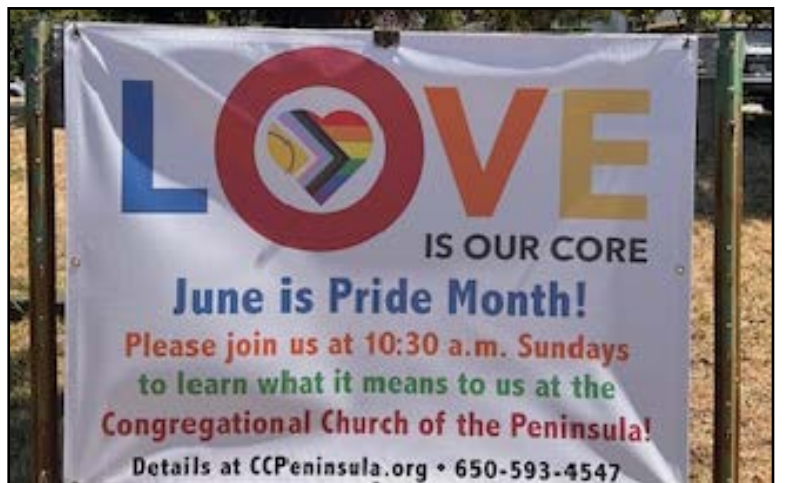
Our own Pride banner displayed on the street in front of the church

To go to the Congregational Church of the Peninsula website, click here .