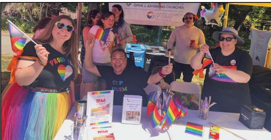
Garrett House joined the San Mateo County Cluster of Open & Affirming Churches booth at the Pride event in San Mateo on June 8.